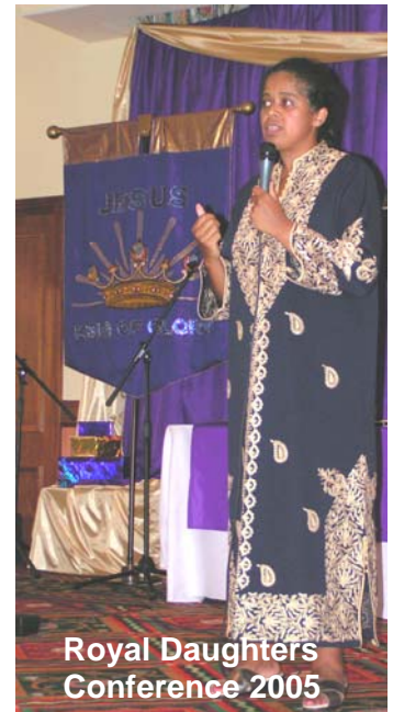
Royal Daughters Conference 2005